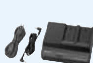
BC-U2 Battery Charger (2-slot)