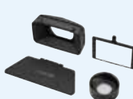
VCL-HG0872K Wide Conversion Lens