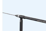
ECM-680S Stereo Microphone