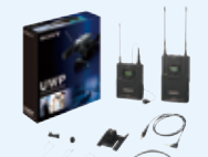
UWP-V1/V2 Wireless Microphone System