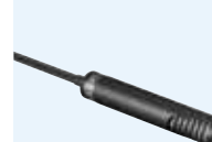
ECM-MS2 Stereo Microphone