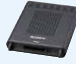
SBAC-US10 SxS Memory USB Reader/Writer